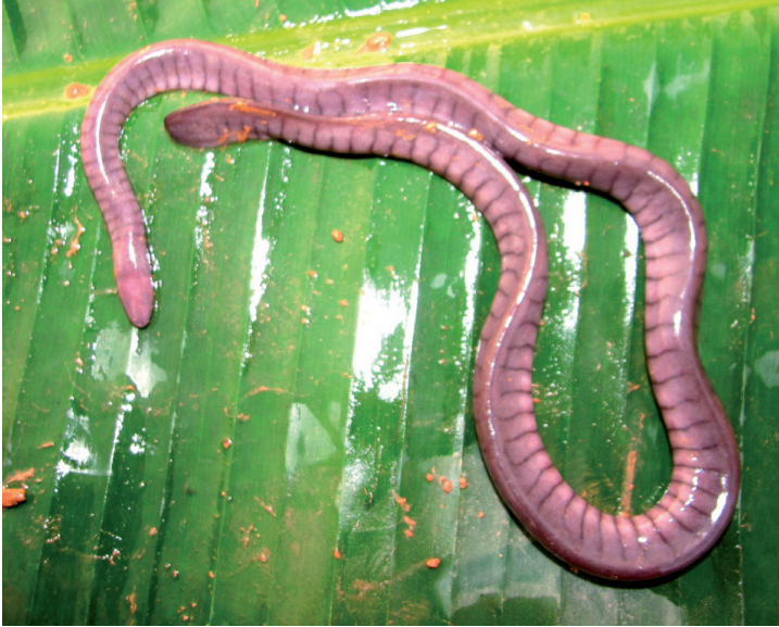
Figure 1. Potomotyphlus kaupii .